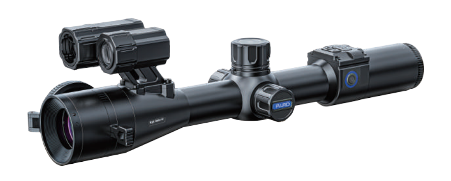
IR &Rangefinder Version